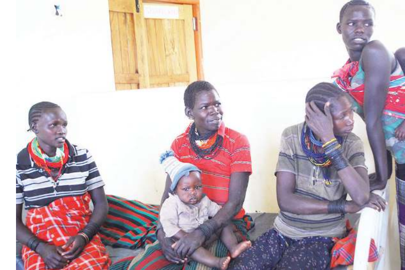
Mothers waiting to receive antenatal services

embarked on sensitising men to get involved in the reproductive health of their wives.