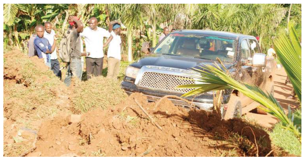
Bobi Wine's car parked strategically to prevent the demolition of Busabala beach

"Nyago filed a case in the High Court of Uganda at